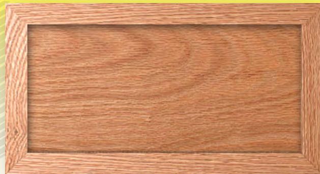
MATCHING DRAWER FRONT Minimum Height: 4"

Construction Method: Cope-N-Stick Outside Edge Detail: MLD-662 Moulding Inside Edge Detail: Slab Panel Detail: Slab Minimum Width: 4" Minimum Height: 4" Max Width: 30" Max Height: 48"