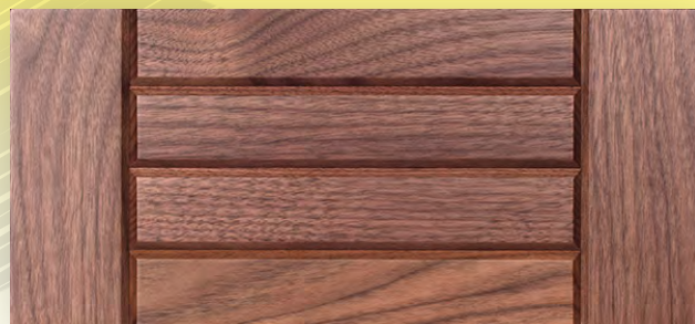
5-PIECE DRAWER FRONT

Construction Method: Cope-N-Stick Outside Edge Detail: OD-6 (Square No Lip) Inside Edge Detail: Scottsdale Panel Detail: European Minimum Width: 7-1/2" Minimum Height: 8" Max Width: 30" Max Height: 72"